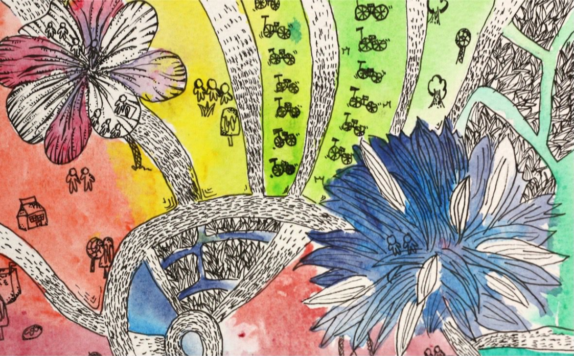
Title: Sustainable City Media: Water Colour