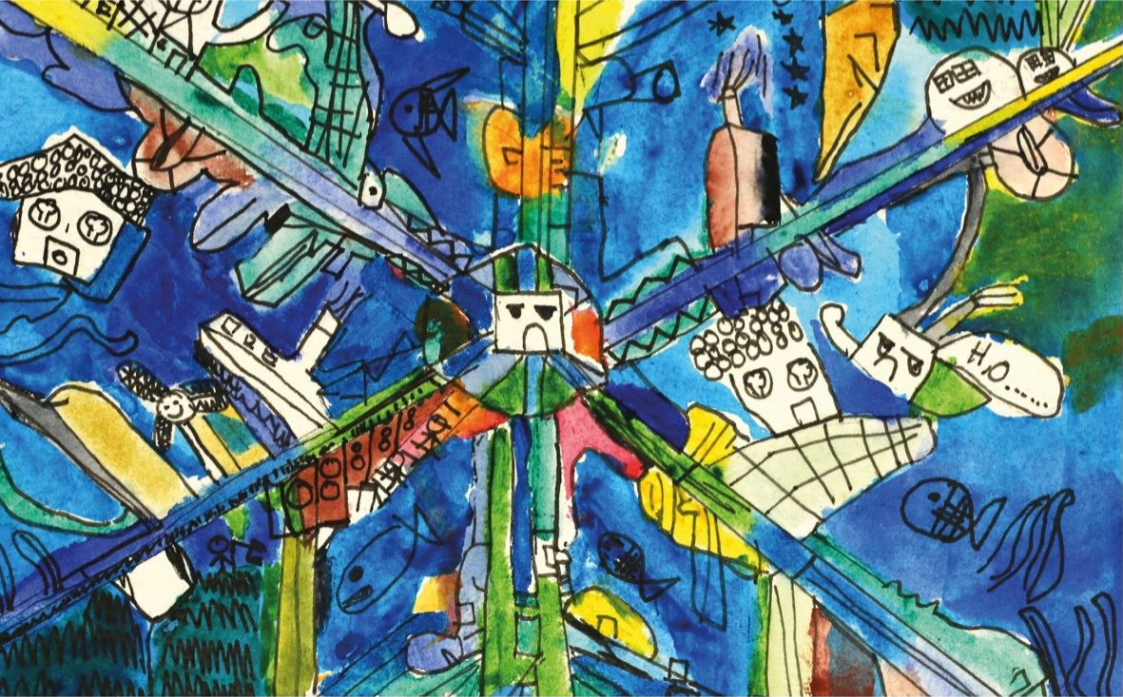
Title: Sustainable City Media: Water Colour