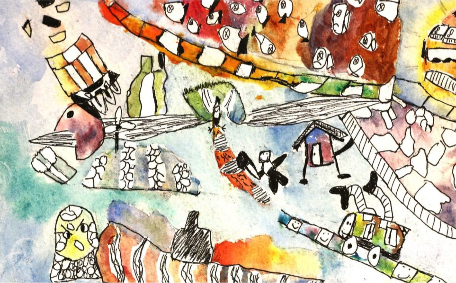
Title: Sustainable City Media: Water Colour