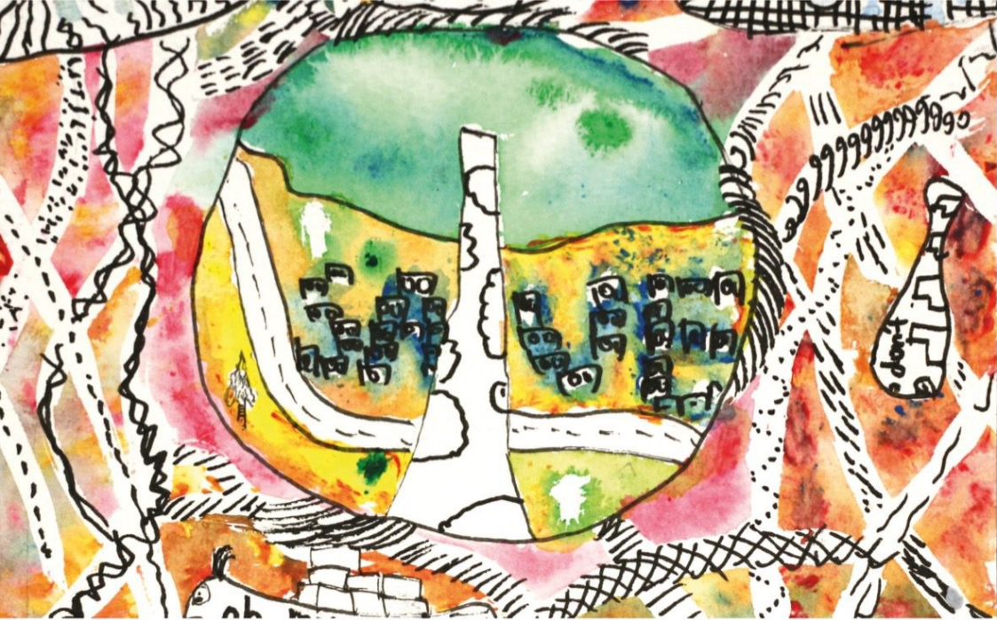
Title: Sustainable City Media: Water Colour