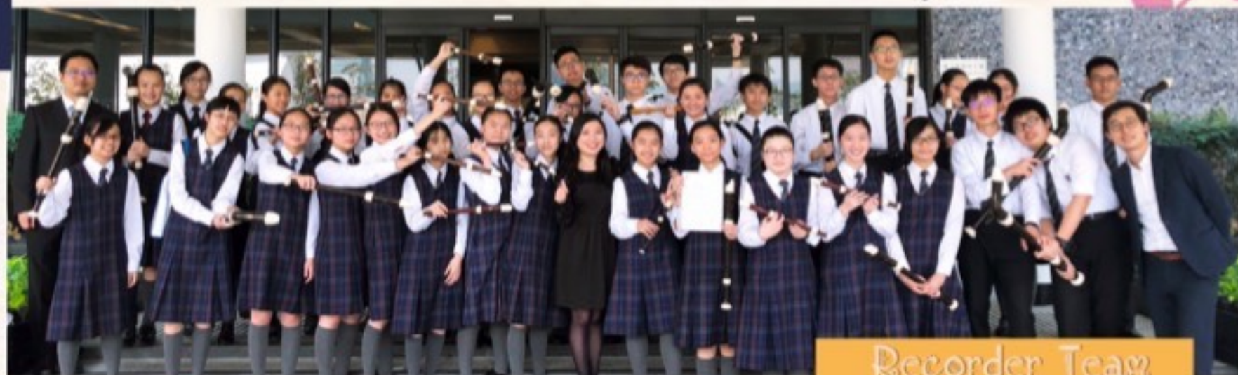
Recorder Band - Secondary School (Hong Kong Region)