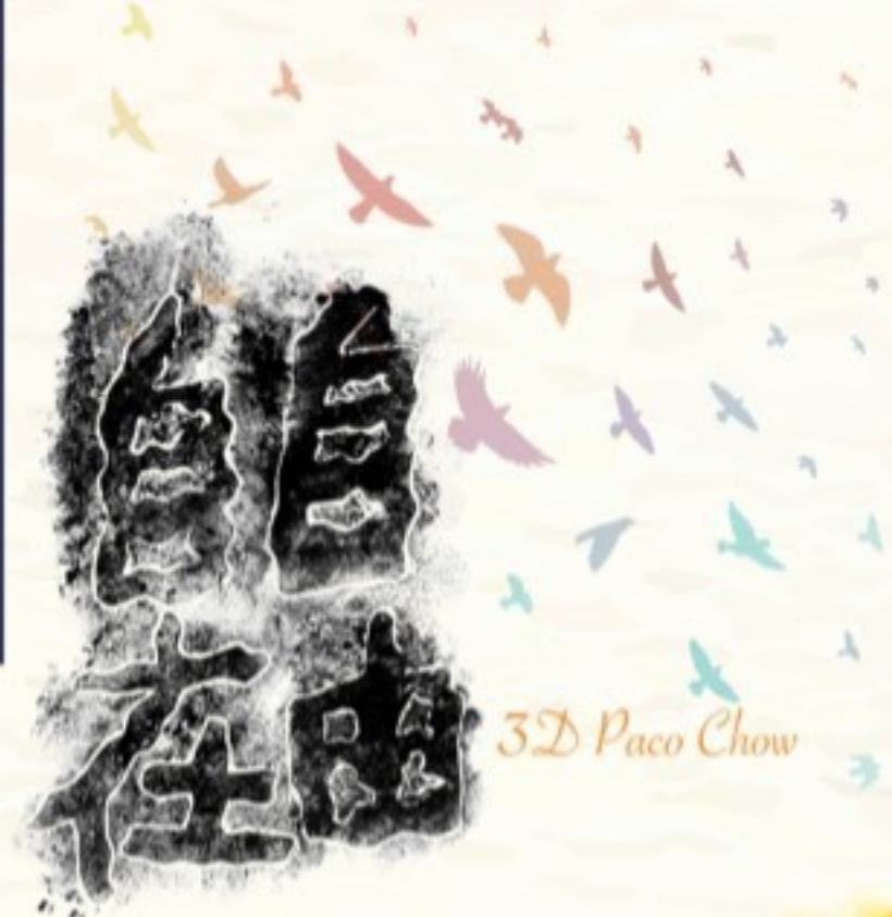
3D Paco Chow