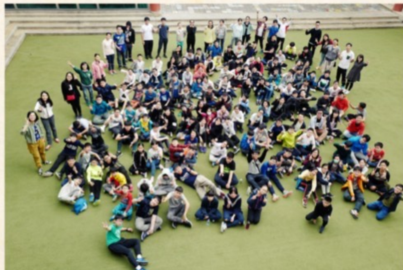
S1 LIFE CAMP