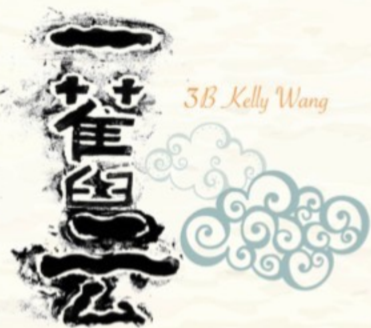
3B Kelly Wang