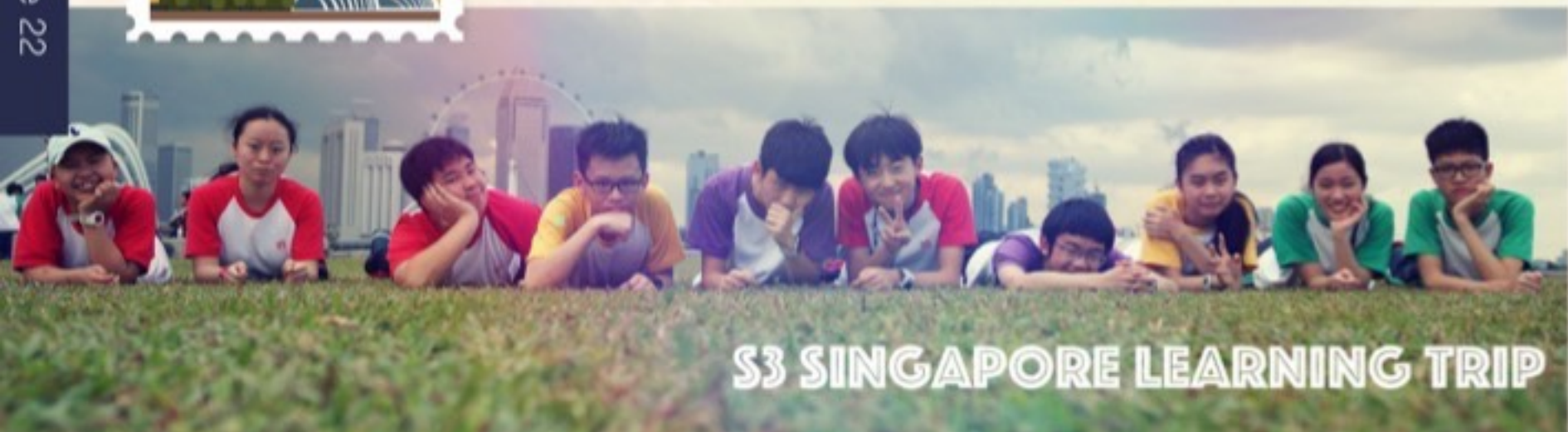
S3 SINGAPORE LEARNING TRIP