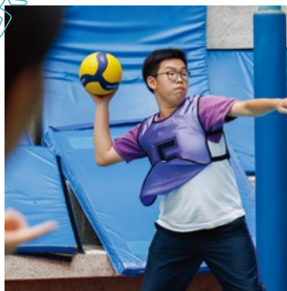
Dodgeball Competition 閃避球比賽