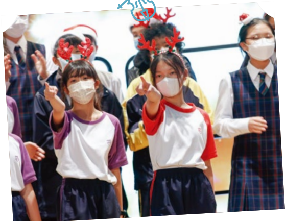
Christmas Music Contest 聖誕節音樂比賽