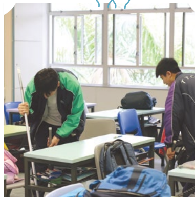
Classroom Cleanliness Competition 清潔比賽 Conduct Competition 操行分比賽