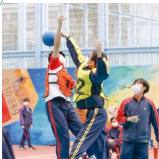
Interclass Competition Assemblies 周會競技比賽