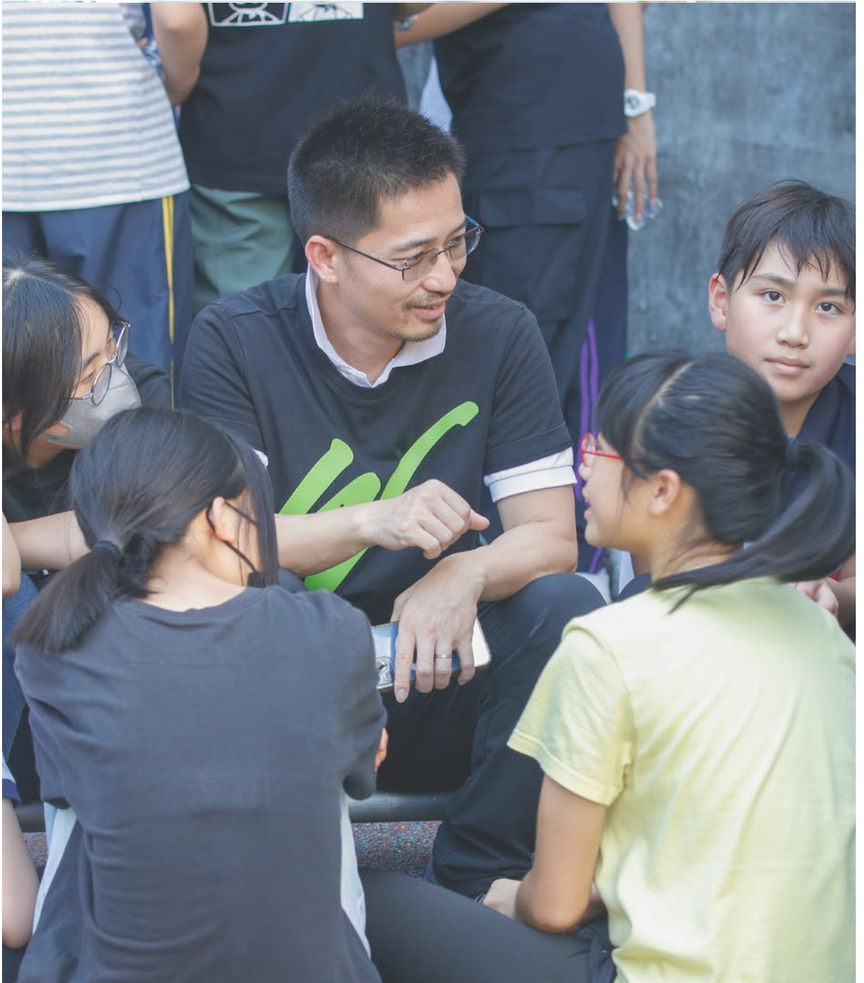
▲ 12-Disciple 十二門徒活動