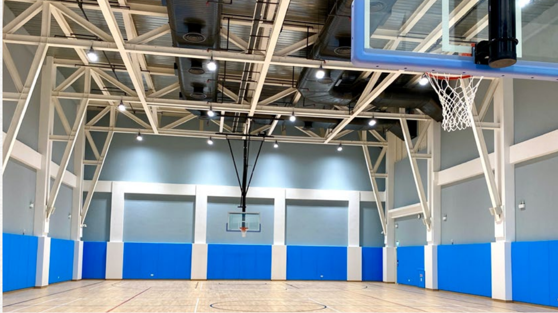
▲ Indoor Sports Centre

Therefore, our campus spatial planning must meet the needs of future education. Since 2018, we have been creating multiple self-study spaces which are prized by many students. In 2019, we invested HK$5,000,000 in constructing a new library and study room where students can be absorbed in the ocean of knowledge. We have also curated cozy study spaces specifically tailored for discussions, e-learning and showcasing learning outcomes. Students are entrusted the co-study space on G/F where they can share the culture of collaborative studying. Extra-curricular activities are normally held in our Performing Arts Studio on 7/F consisting of a drama studio, dance studio and music studio to nourish students' potential and talents in performing arts. In 2020, air-conditioners were installed in the Covered Playground to increase spaces for student activities. In 2022, an Indoor Sports Centre consisting of a standard basketball court, a standard volleyball court and three badminton courts were constructed, allowing students to tap into their athletic potential. In the academic year of 2023-2024, the entire 7/F will be transformed into a STEM Lab. It is anticipated that such works can build close connections with parents and the community to bring benefits to the learning environment.