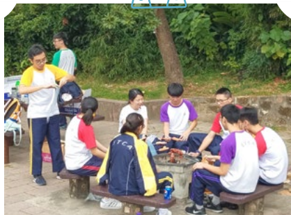
School Picnic 旅行日