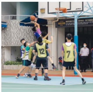
S.6 Basketball Graduation Cup 中六籃球畢業盃