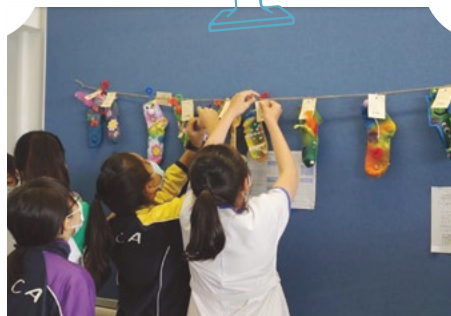
Classroom Board Design 課室壁報設計