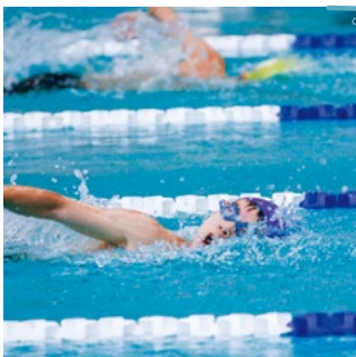
Interclass Swimming Relays 班際接力自由泳